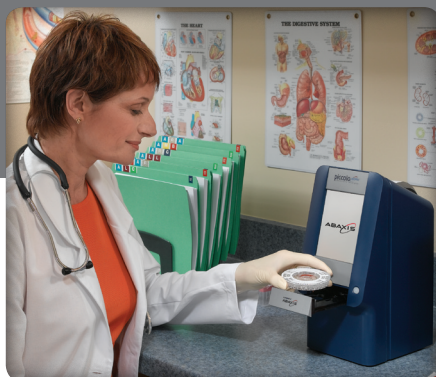
2 / Insert rotor