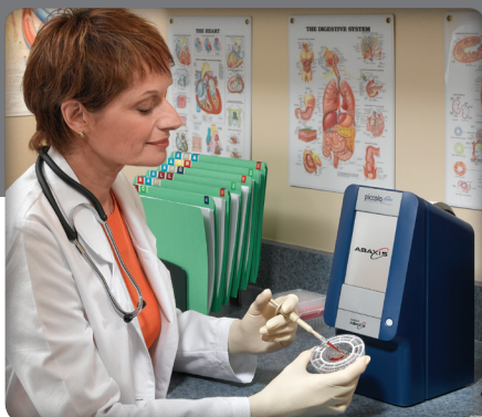
1 / Add sample